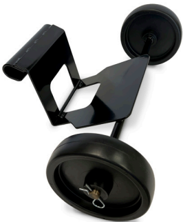
(PC800 kit pictured)

Our optional wheel kit attaches to Sakai plate compactors allowing easier transport for loading and around the job site.