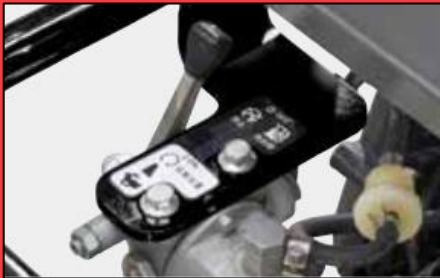
Throttle lever acts as fuel-cutoff