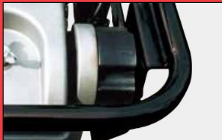
Reduced shock vs. competitors