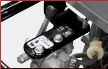
Throttle lever acts as fuel-cutoff