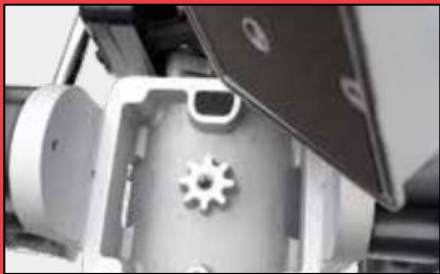
Multi air cleaner for extd. maint.